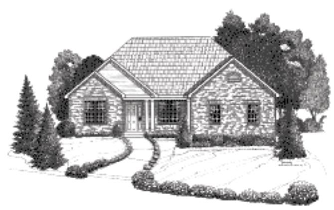
Sterling A - Hip Roof