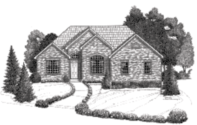
Sterling B - Hip Roof