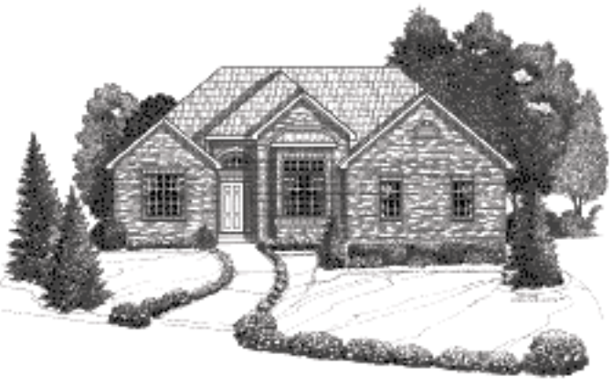
Sterling C - Hip Roof