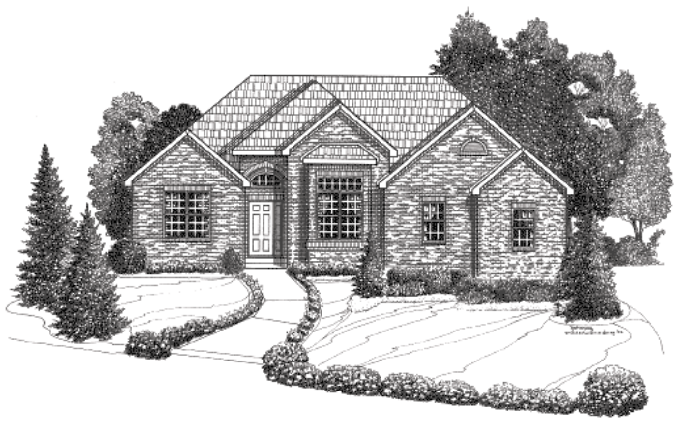
Sterling C - Hip Roof (Optional 3-car garage)